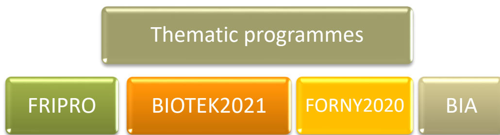
Figure 1: The BIOTEK2021 programme has a role between the open competitive arenas FRIPRO, BIA and FORNY2020.

Figure 1 shows the BIOTEK2021 programme's role in relation to other Research Council instruments.