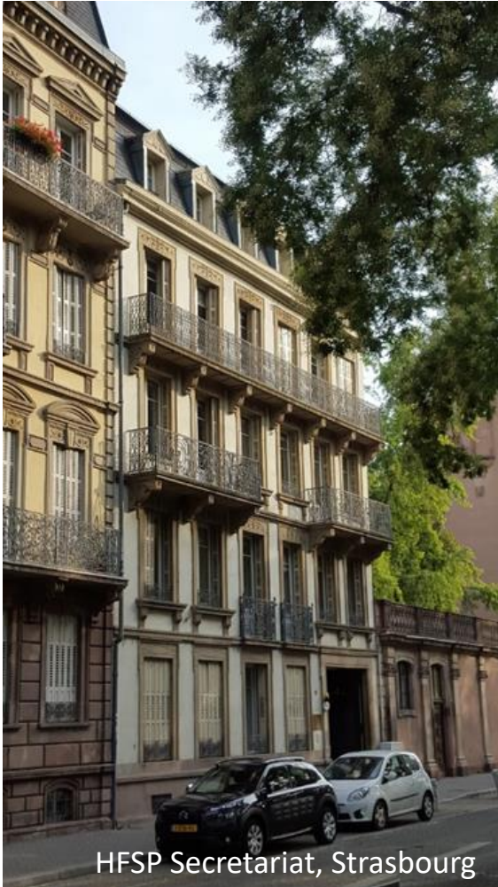
HFSP Secretariat, Strasbourg