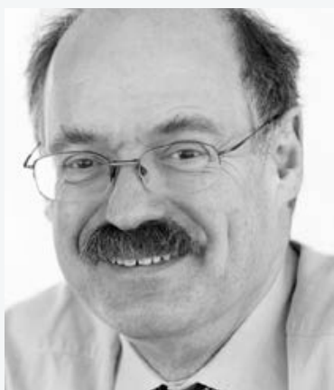
Sir Mark Walport